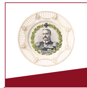
Wall plate Hindenburg was the most popular German military commander.