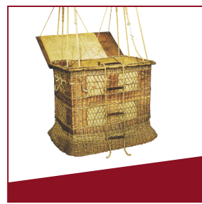
Balloon gondola Tethered balloons were used as observation platforms.