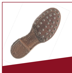
Jackboots The soles of the marching boots were studded with nails.