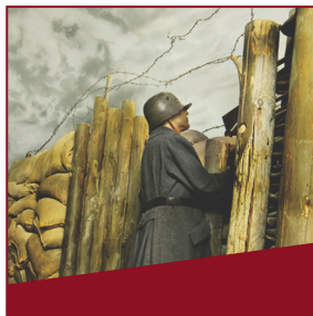
Trench warfare One room contains a mock-up of a frontline trench.