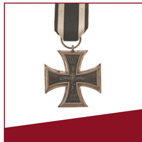
Iron Cross How a war decoration became a national symbol.