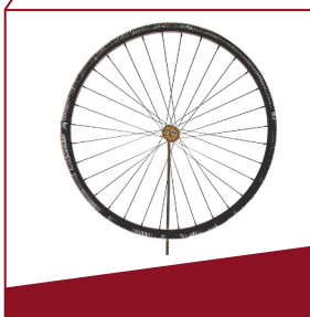
Bicycle tyre made of wire Rubber was scarce. Here it substituted by a spiral wire.