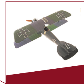
Aircraft model Fighter aircraft Albatros D V of 1917.