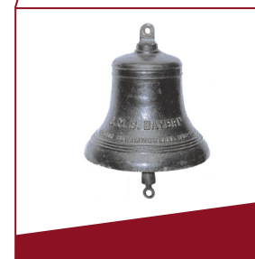
Ship's bell This bell comes from the battleship "Bayern".