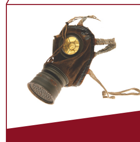
Gas Mask Since 1915 gas masks were part of the personal equipment.